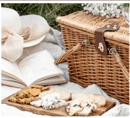
Picnic in the Woods

Get our team to pack a picnic basket for you. Have a fun time by the pristine pine forests.